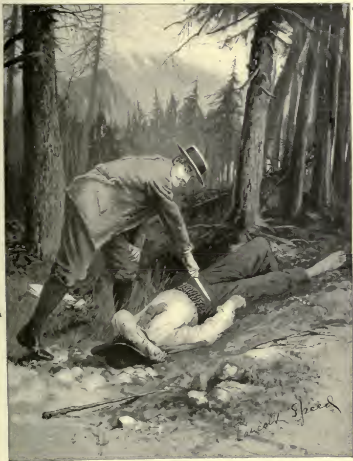
WIPING ITS BLADE ON THE CLOTHES OF THE PROSTRATE MAN.—Page 69.